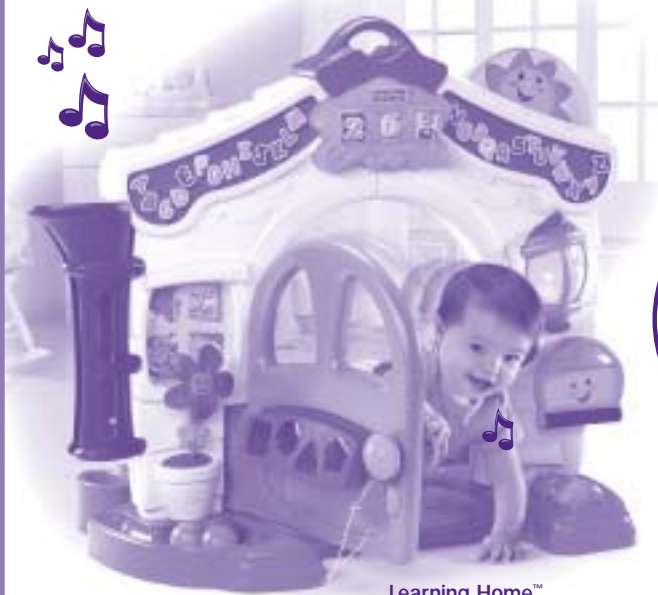
Learning Home™ C6327

Collect all these Laugh & Learn™ toys. Each has a special place in the Learning Home!