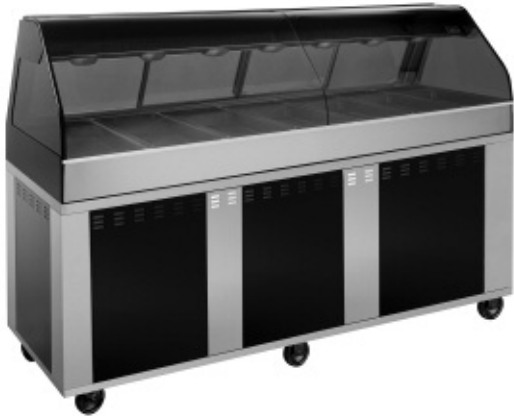
EU2SYS-96 FRONT VIEW SHOWN WITH OPTIONAL CASTERS

• HALO HEAT ... a controlled, uniform heat source that gently holds and surrounds food for better appearance, taste, and longer holding life.