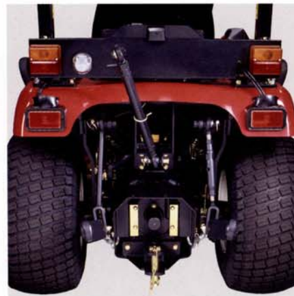
Category I Three Point Hitch & Fixed Drawbar