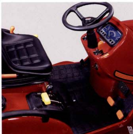
Operator-Friendly Instrument Panel, Levers, and Pedals