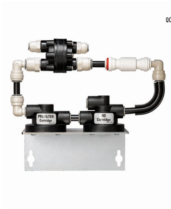
QC Twin Series RO Head: EV9272-26

Series filter head exclusively for Everpure replacement cartridges