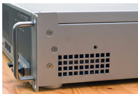
Figure 1: Installed mounting brackets

The following photos illustrate how the brackets should be mounted. Note that the screw configuration may vary depending on your FortiGate unit.