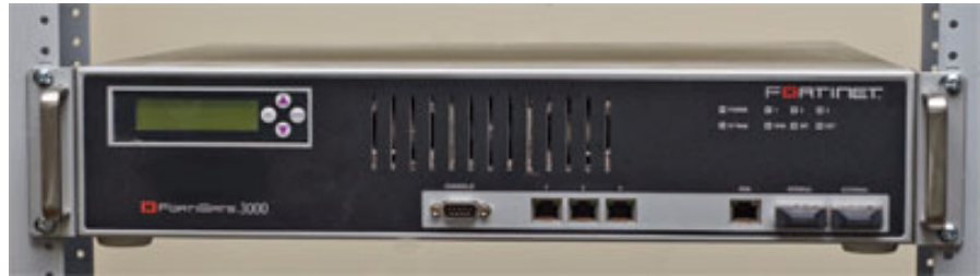
Figure 2: Mounting in a rack

The following photos illustrate how the mounting brackets and FortiGate unit should be attached to the rack.