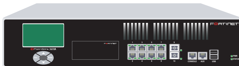
Figure 1: FortiGate-3600A