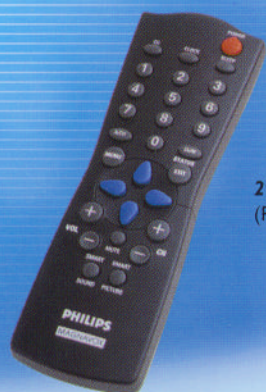
29-Button Total Remote (Remote # RCL9UB/04)