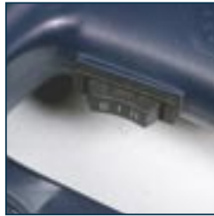
Position 1: 50° - 550°C