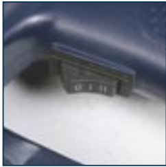
Position 2: 50° - 650°C