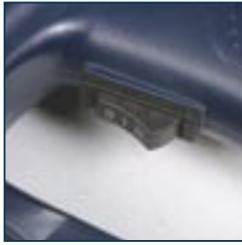
Position 0: Stop/Off

The rocker switch can be adjusted to 3 positions and these are: