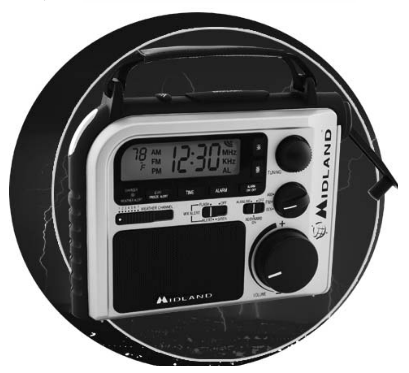
ER102 | Emergency Crank Weather Radio Owner's Manual