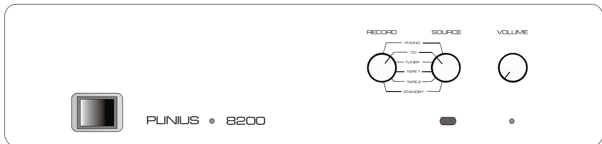
FRONT PANEL LAYOUT SHOWING VOLUME KNOB, RECORD AND SOURCE SELECTORS, DISPLAY LED'S AND MAINS SWITCH

The front of the Plinius 8200 Integrated Amplifier incorporates all the facilities you will require on a daily basis.