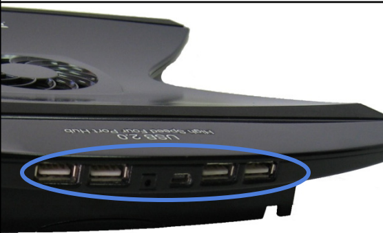
USB 2.0 Hub

integrated 11 blade desktop quality cooling fan delivers superior cooling capacity