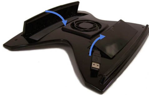
collapses for transport