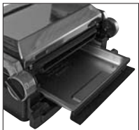
figure 5 INCORRECT

The FLOAT position is best used with thick, crusty breads, such as French, Italian, and focaccia. The top grill plate will compress and grill a Panini to perfection in about 3 minutes (depending on the bread, filling, and personal taste). The FLOAT position can also be used to grill a variety of food items, such as meats, poultry, fish, and vegetables. Always preheat your Tri-Grill in the closed position as shown in figure 1.