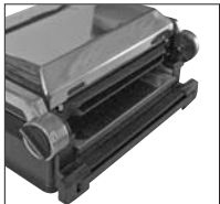
figure 4 CORRECT

Cooking in the FLOAT position (see fig. 3) allows both the LOWER and UPPER plate to contact the food. Food cooks much faster than traditional open grill cooking. Grease drains away to the drip tray located below the LOWER plate. This position is most commonly used to cook Panini Sandwiches.