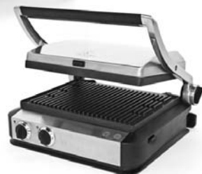
FIXED HEIGHT position