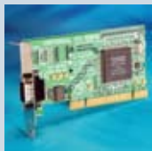
UC-235: UNIVERSAL 1 PORT RS232 LOW PROFILE