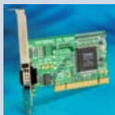
UC-246 UNIVERSAL 1 PORT RS232