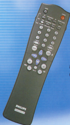
Universal TV/VCR/Cable Remote (Remote # RCUB1BX)