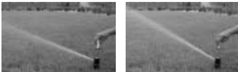
Trjectory™ (Radius and height of spray adjustment)

With the use of the simple adjustment band technology of the TR50XT, the TR70XT is just as convenient but made to withstand the pressure of commercial applications, such as sport fields. All features, including the exclusive, patented X-Flow® water shut-off and trajectory adjustment, are located beneath a safe, rubber cover.