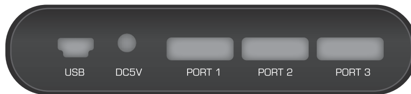
USB mini-B USB Hub