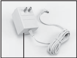
TV AC Adapter (large)