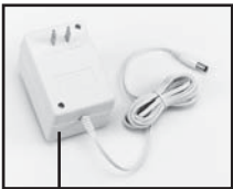
Camera AC Adapter (small)