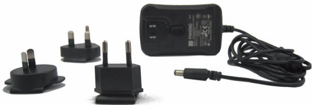
Figure 1.1 AC/DC Adaptor