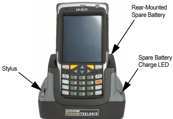
Figure 2.1 Desktop Docking Station Front View