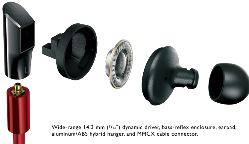
Wide-range 14.3 mm ( \frac{9}{16} ") dynamic driver, bass-reflex enclosure, earpad, aluminum/ABS hybrid hanger, and MMCX cable connector.