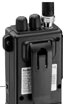
12V DC PWR Jack