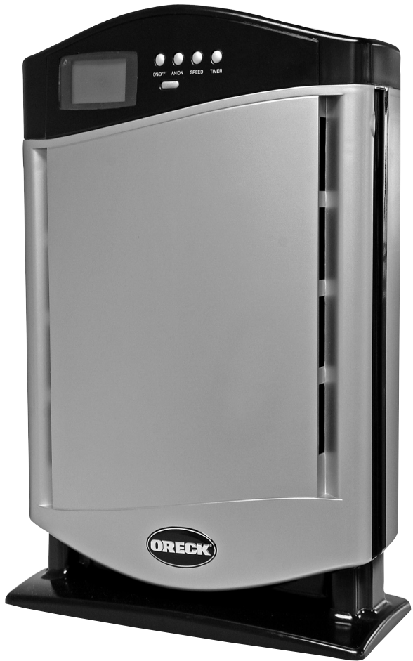
Oreck Air Purifier with HEPA Filtration

Read this manual carefully, and keep for future reference.