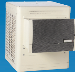
RC40W 4,000 cfm