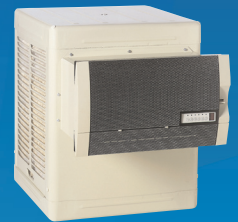
RC30W 3,000 cfm