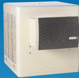
RC45W 4,500 cfm

* Industry Standard Rating is a numerical index for use in comparing units of different manufacturers. ** All models are 120 Volts, 60 Hz *** Blower motor (high speed) and pump