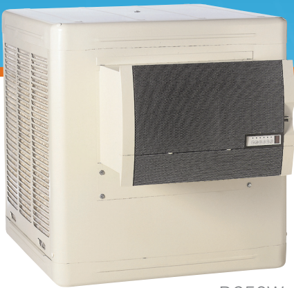
RC50W 5,000 cfm

AUTOMATIC DRAIN PUMP – MODEL #CM120A – CleanMachine® replaces the bleed-off system in your cooler, helping it save water and stay cleaner by automatically draining the sump every six hours of continuous cooler operation.