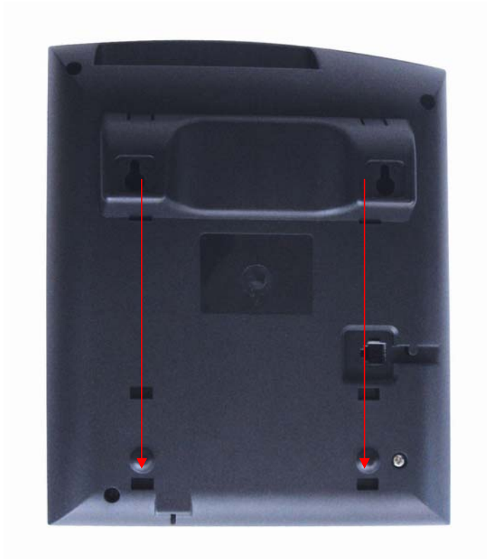
Figure 2: Attach the base stand to the bottom part of the phone to tilt is backwards.

To position the phone on the wall, place a fixed hanger on the wall, hang the back of the phone on the fixed hanger.