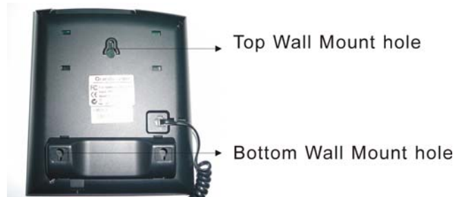
Figure 3: Location of the fixed hanger on GXP280

To use the handset, pull out the tab (extension downward) from the handset cradle, rotate the tab and plug it back into the slot with the extension up to hold the handset.