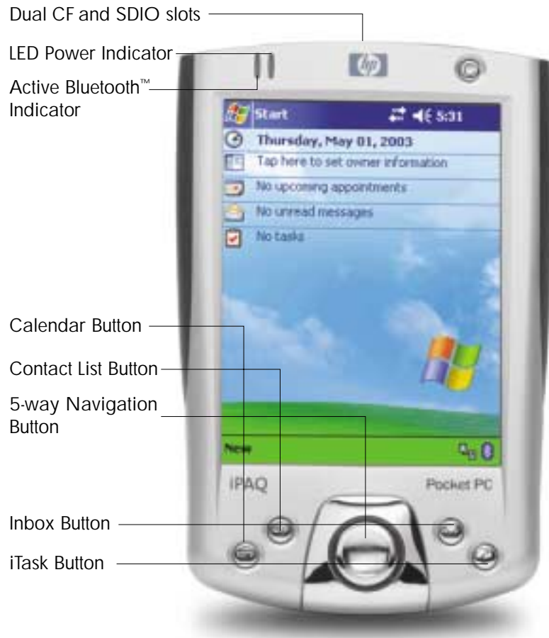
The HP iPAQ models in the h2200 series are Microsoft® Windows® Powered Pocket PCs