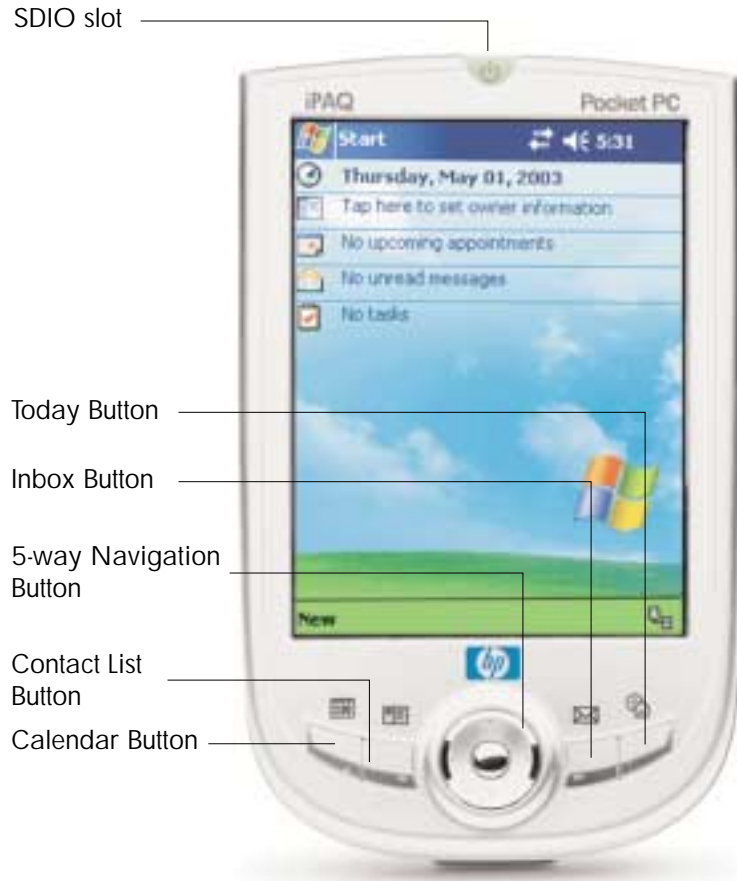
The HP iPAQ models in the h1900 series are Microsoft® Windows® Powered Pocket PCs