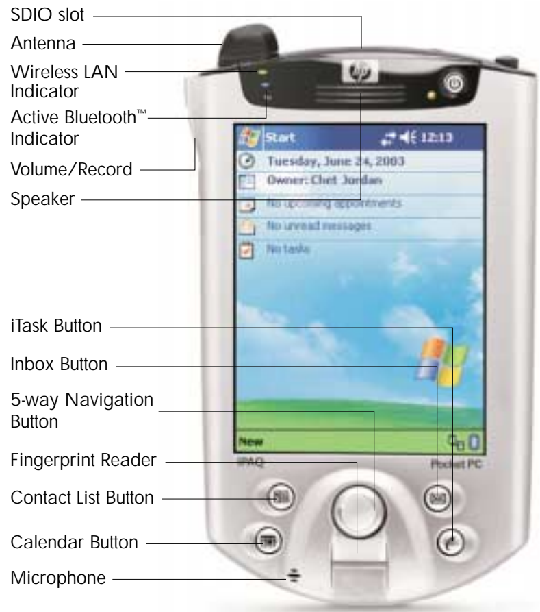
The HP iPAQ models in the h5500 series are Microsoft® Windows® Powered Pocket PCs

It helps you run your business from almost anywhere