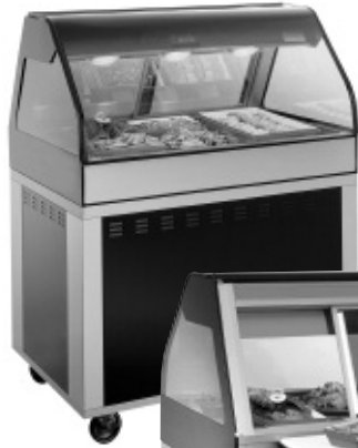
EU2SYS-48 FRONT VIEW SHOWN WITH OPTIONAL CASTERS

• HALO HEAT ... a controlled, uniform heat source that gently holds and surrounds food for better appearance, taste, and longer holding life.