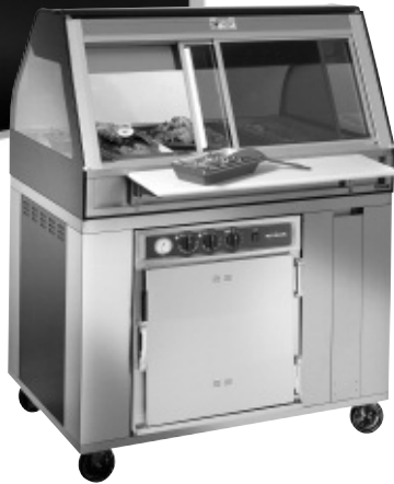
EU2SYS-48 BACK VIEW SHOWN WITH 750-TH-II COOK AND HOLD OVEN AND OPTIONAL CASTERS