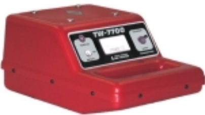
The TW-7700 Transmitter.

WARNING: Do not handle output leads unless power is off. ELECTRIC SHOCK HAZARD: Servicing to be performed by qualified personnel only.