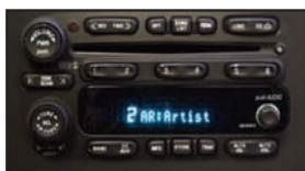
Factory Radio (not included)