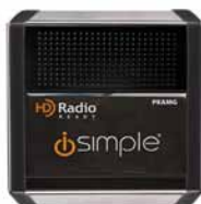
GateWay™ Interface (not included)