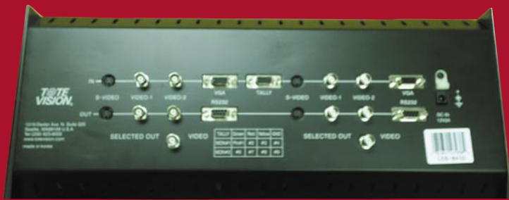
Back View of LCD-841D