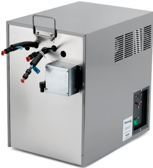
Exubera Pro UC: EV9333-50

High volume premium water appliance for drinking water