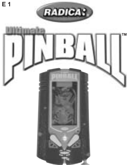
MODEL 73021 1 player / Ages 8 and up INSTRUCTION MANUAL P/N 82375510 Rev.A

To exit demo mode, press the Reset button on the front of the game.