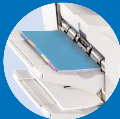
Multiple finishing options provide the capability to create professional, finished documents in-house.