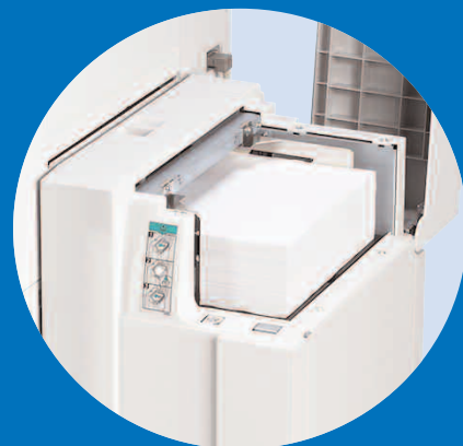
The large capacity tray holds 4,000 sheets of paper, and can be converted to hold 2,500 sheets of 8.5" x 14" with option.