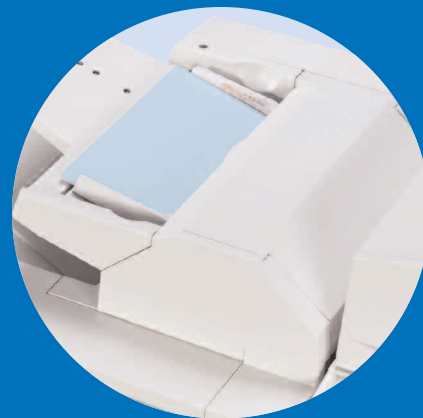
Insert pre-printed sheets as covers and slipsheets with the Cover Interposer.