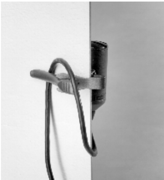
CABLE ANCHORING FIGURE 4

Insert the SM11 in the tie clasp and anchor the cable as shown in Figure 4. Affix the clasp to a tie, shirt, or blouse. Note that the microphone can be swiveled 360° in its holder for left, right, or vertical ("pen clip") use.