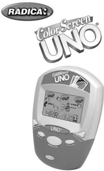
M0253 For 1 player / Ages 7 and up INSTRUCTION MANUAL P/N 823B3300 Rev.B