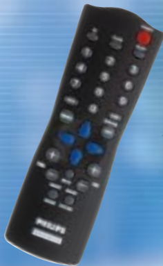
29-Button Total Remote (Remote# RCL9UB/04)