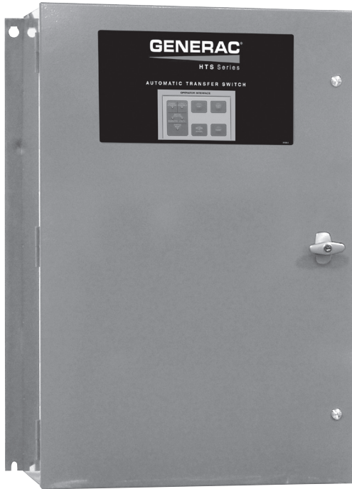
200 Amp HTS NEMA 1