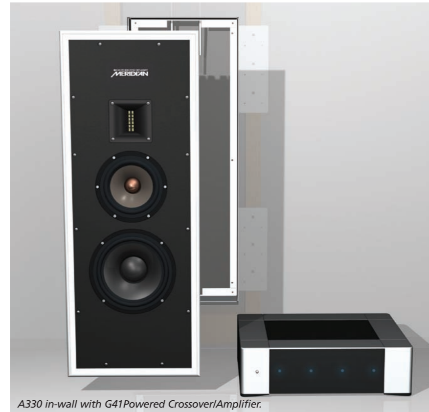
A330 in-wall with G41 Powered Crossover/Amplifier.

Meridian loudspeaker systems for in-wall and flush-mount applications