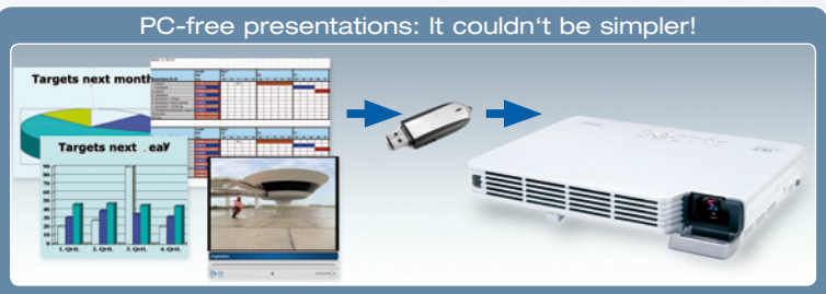
Convert the files, save them on a USB stick, slot the stick into the projector - and you're done

Tip: You can also use this practical function on the XJ-S31 and XJ-S41 with the help of the presentation kit YP-100 (see page 9)!