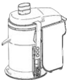
Right Hand Assembly

NOTE: For your juicing convenience, your Juiceman® JM418SS can be assembled for right-hand or left-hand use. Right hand use allows the user to place produce into the Feed Tube with the left hand while operating the Food Pusher with the right hand. If you are left-handed, or feel the juicing operation is uncomfortable, you can reverse the assembly instructions below so the Juice Spout is to the rear of the unit (and all subsequent parts will face the opposite way).