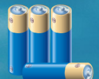
4x AA BATTERY