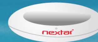
BLUETOOTH® AV DONGLE