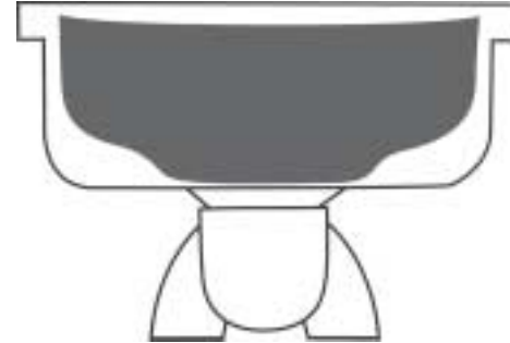
Properly Leveled Coffee