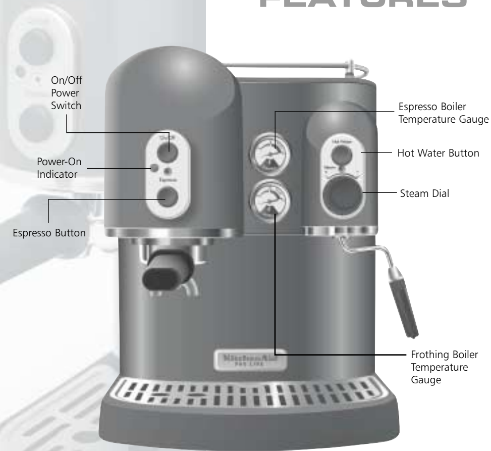
Model KPES100 Espresso Machine