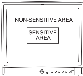
Figure 2. Backlight Compensation