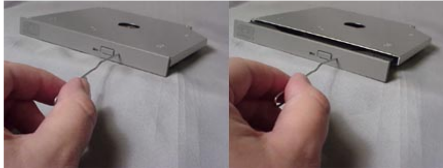
Figure 2.Using Emergency Eject