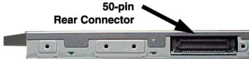
Figure 1. SD-R6372 DVD Writeable Drive Rear Panel – Connector

ATAPI Connector A 50-pin ATAPI interface connector is found at the rear of the SD-R6372 DVD rewriteable drive. Connecting cable should use Japan Aviation Electronics Industry Limited KX14-50 Series L or equivalent connector.