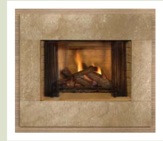
Walnut Travertine surround