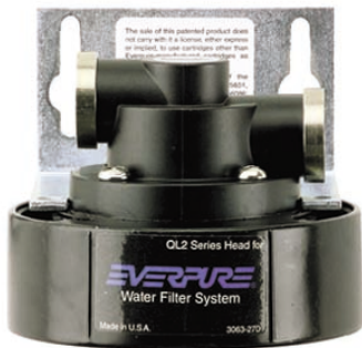
QL2 Single Head: EV9272-19 (12 pack)

Filter head exclusively for Everpure replacement cartridges