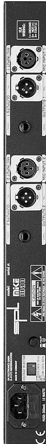
Rearfront MIKEMAN, Model 9523

Both output stages operate in parallel, so it is possible to connect two different destination units simultaneously, for example to record to two different media at the same time or split the output between a mixer and effects processor.