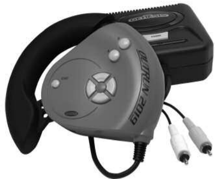
Model 75043 For 1 player / Ages 8 and up INSTRUCTION MANUAL P/N 82392110 Rev.B