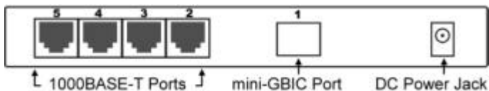
Rear panel view of the Switch

The rear panel of the Switch consists of 4 1000BASE-T ports, 1 mini-GBIC port, and DC power connector.