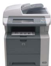
HP LaserJet M3027 MFP (CB416A)