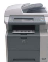
HP LaserJet M3027x MFP (CB417A)

All the features of the base model, plus: