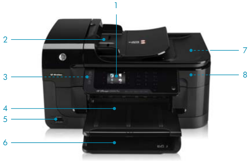
HP Officejet 6500A Plus e-All-in-One shown