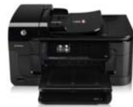
HP Officejet 6500A Plus e-All-in-One