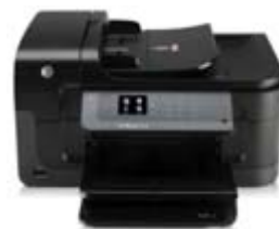
HP Officejet 6500A e-All-in-One