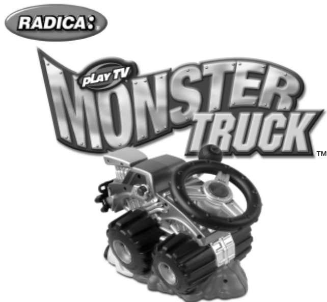
Model 74026 For 1 player / Ages 8 and up INSTRUCTION MANUAL P/N 82385500 Rev.A

The roar of your engine barely drowns out the roar of the crowd! You hit the gas and your truck springs to life, tearing onto the arena floor. Cheers mix with the sounds of crunching metal as you smash into other monster trucks. You're number one and on top of the world! Play TV Monster Truck not only puts you on top of the world but also behind the wheel of your very own monster truck. Are you ready to tame this 1500 horsepower, metal-crunching machine?