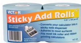
140 Sticky Add Roll