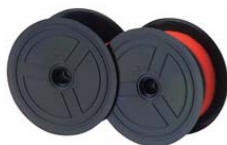
7010 Twin Spool Ribbon