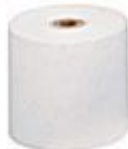
7050 Paper Rolls